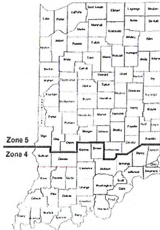
TABLE N1101.2 CLIMATE ZONES AND MOISTURE REGIMES OF INDIANA COUNTIES Key: A – Moist